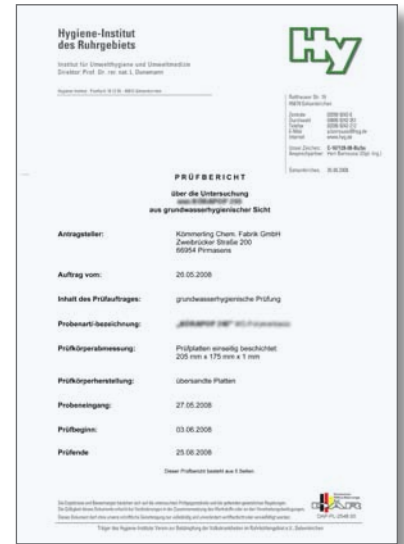
Test report MSP-1

"Considering the fact that [MSP-1] remains effectively embedded within the sheet pile interlocks for typical applications, we believe that an appreciable impact on water in contact with the structure can be ruled out."