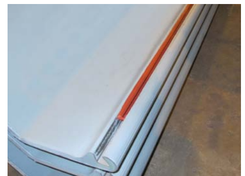
MSP-1 product extruded into the interlock