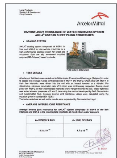
Certified test report