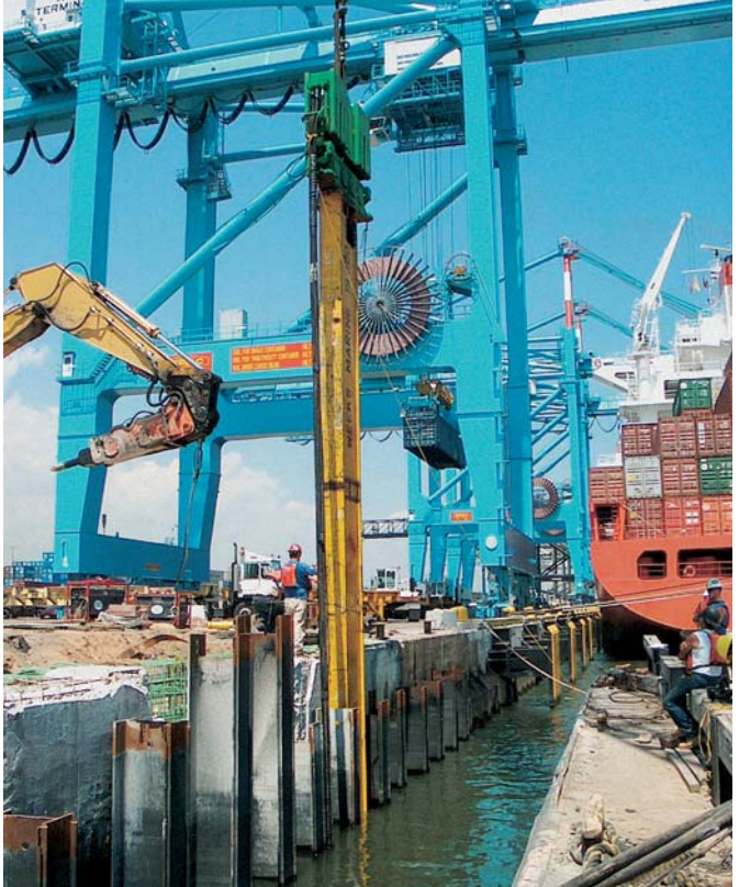
A special beam transmitted the vibration energy to the underwater AZ-piles