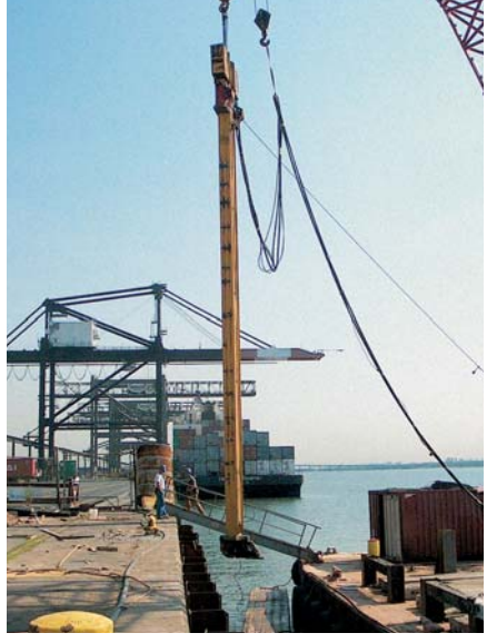
The installation equipment was not submerged