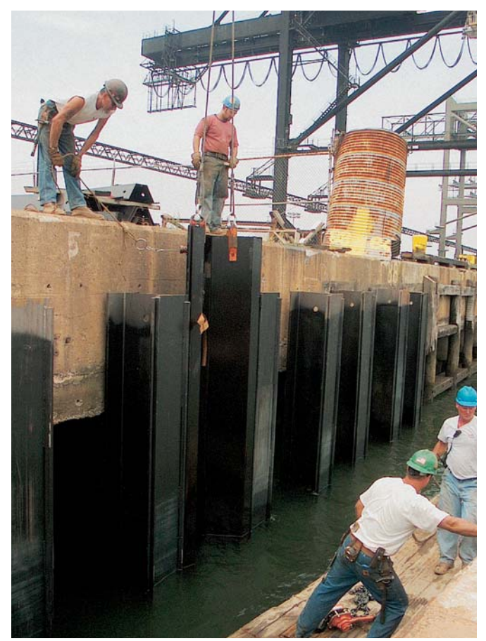
The heads of the HZ king piles remained above the water line, which facilited their installation...