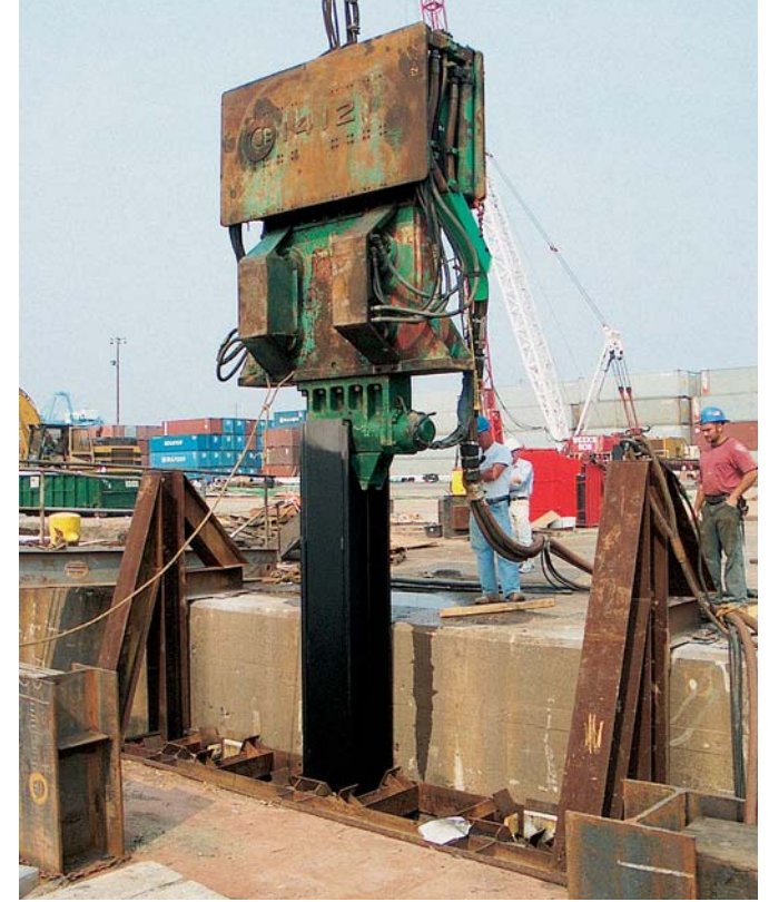
King-pile driving with two-layer template