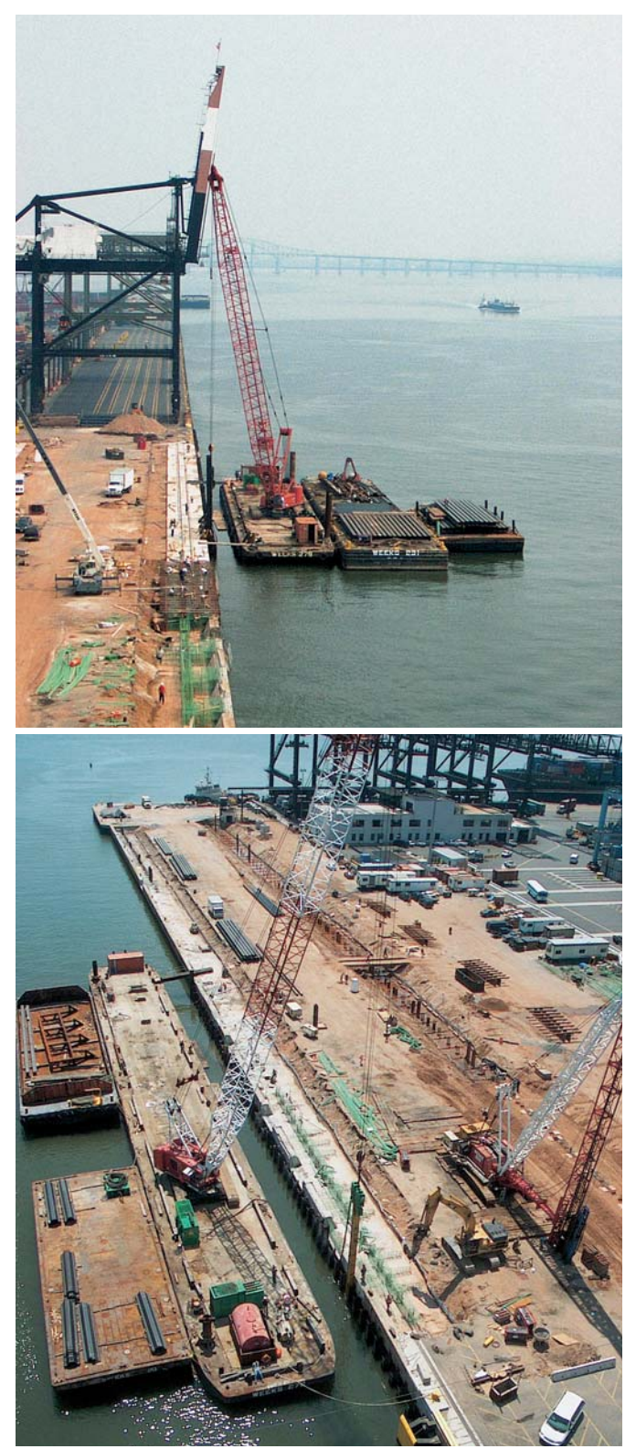
The water depth of the Elizabeth Marine Terminal was increased from 10 m to 15.2 m \,

Port Elizabeth is located close to Newark International Airport and a stone's throw from New York City. The Port Authority of New York & New Jersey recently decided to upgrade the thirty-year-old wharf structures at the Elizabeth Marine Terminal to handle the next generation of container vessels. A five-phase plan was created to overhaul the old wharf structures at Berths 82 through 98 by increasing crane and mooring loads as well as the water depth at the wharf face. Another vital point was to equip the wharf with cranes reaching up to 18 containers wide, thus enabling the latest generation of Super Post-Panamax vessels to be handled. In parallel with the terminal upgrading project, the Army Corps of Engineers currently plans massive dredging operations to deepen the harbour bed to 15.2 m to accommodate the most modern container ships.