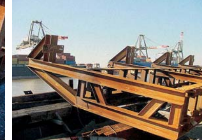
Neoprene shields attached to the template protected the coating system during installation