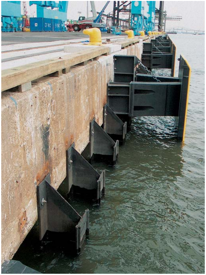
...and provided an ideal support for the fenders of the terminal

The king piles also acted as a guiding frame for the installation of the intermediary sheet piles. The contractor did not want to submerge the vibratory hammer and thus opted for a special beam that transmitted the vibration energy from the installation equipment to the AZ piles throughout the driving process to design depth. The underwater AZ sheet piles prevent soil erosion due to the turbulence caused by ships' screws.