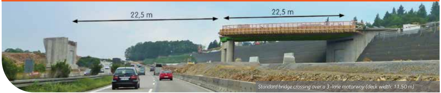
Standard bridge crossing over a 3-lane motorway (deck width: 11,50 m)

A case study, performed by the Karlsruhe Institute of Technology (KIT), assesses all associated costs and performance of a traditional concrete bridge versus a bridge whose abutments are constructed using steel sheet pile sections. This comparison is performed for a two-span superstructure with spans of 22,50 m and a superstructure width of 11,50 m accounting for a standard crossing of a national road over a 3-lane motorway with an average daily traffic (ADT) of 70'000 vehicles: