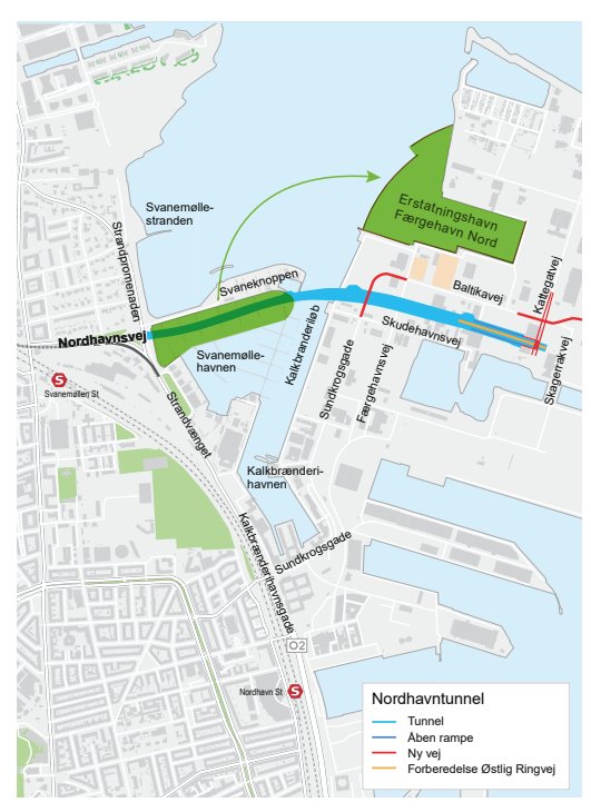
Layout of the temporay marina